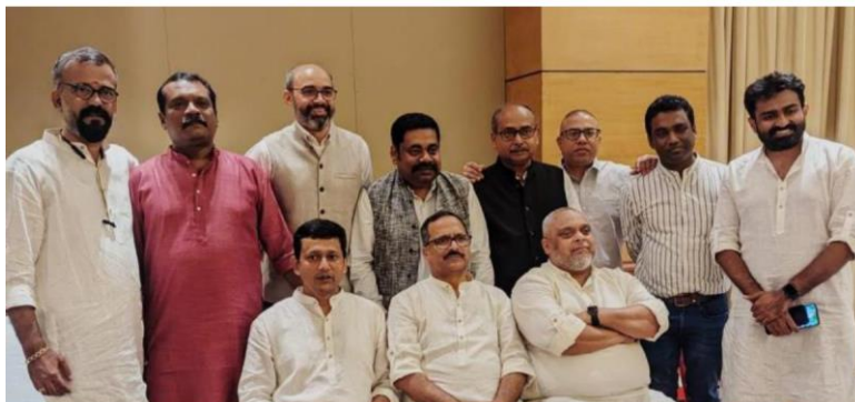
AIBOC Secretariat Team with the President & GS of AIBOC and GS AISBOF