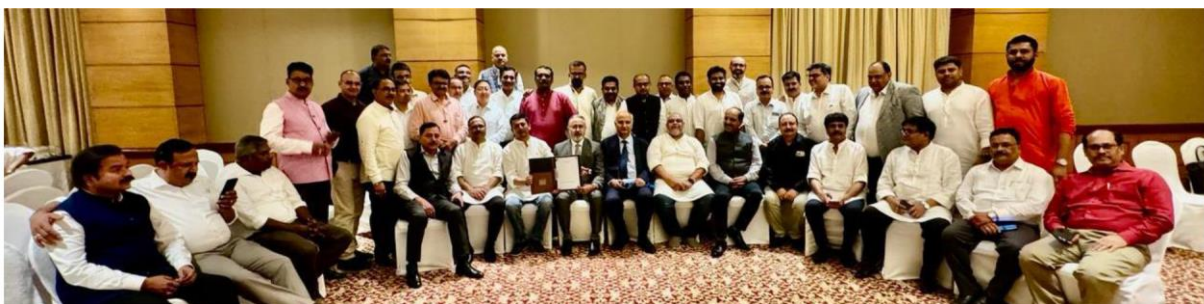
Team AISBOF with IBA Officials after the signing of 09th Joint Note